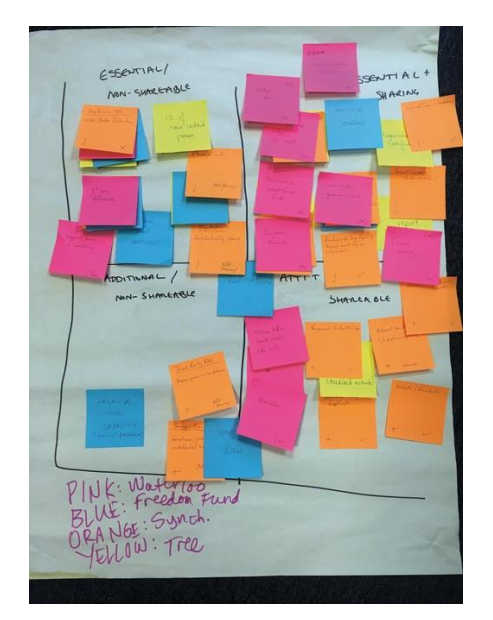
Funders compared their information requirements (Rose Longhurst)

The length and complexity of requirements should be scaled appropriately according to the size and level of risk associated with the grant, whereby small, low-risk grants need not require a lengthy and onerous due diligence process